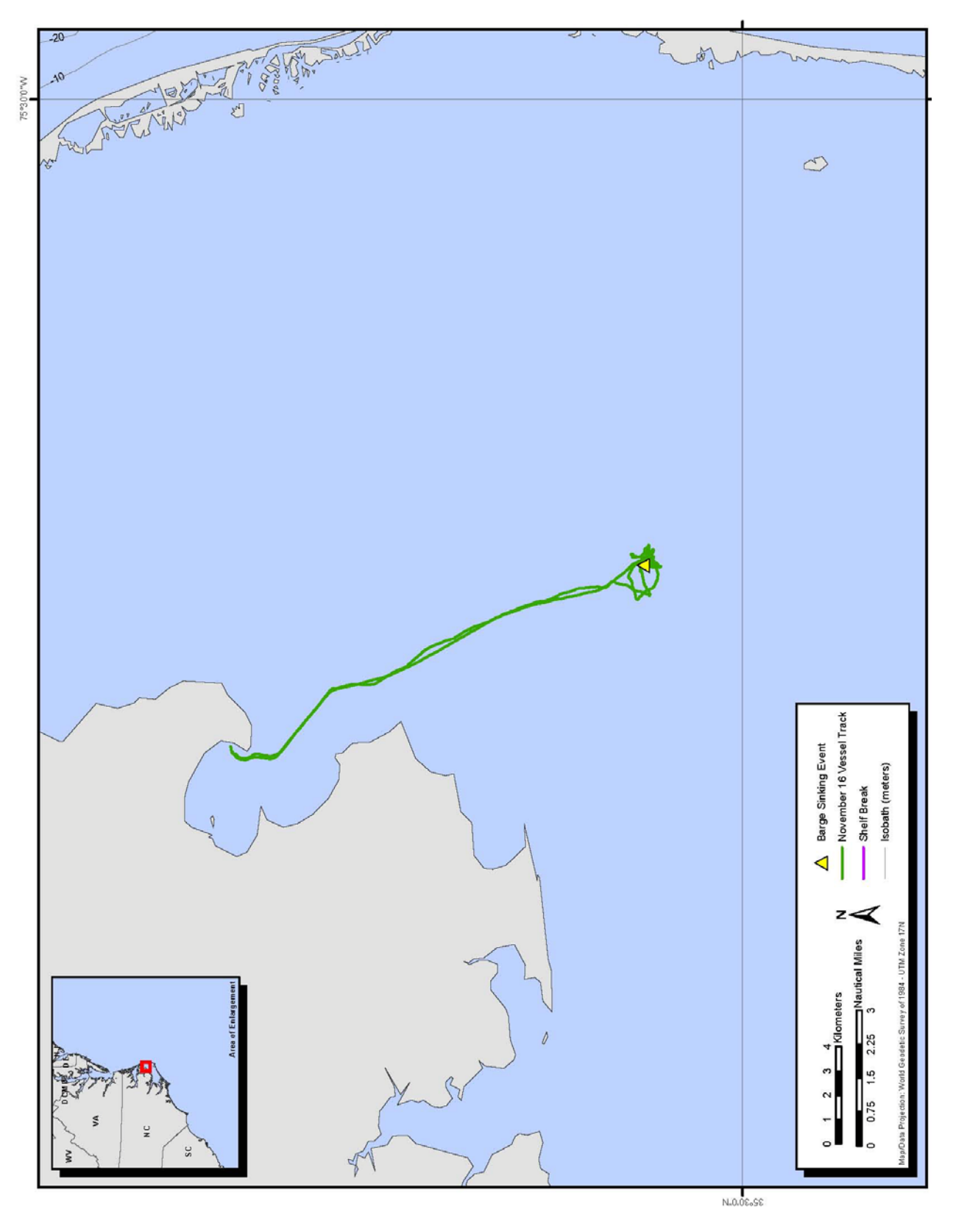
Figure 2. Tracklines for 16 November 2011 Survey Effort for Pamlico Sound Barge Sinking Event Monitoring.