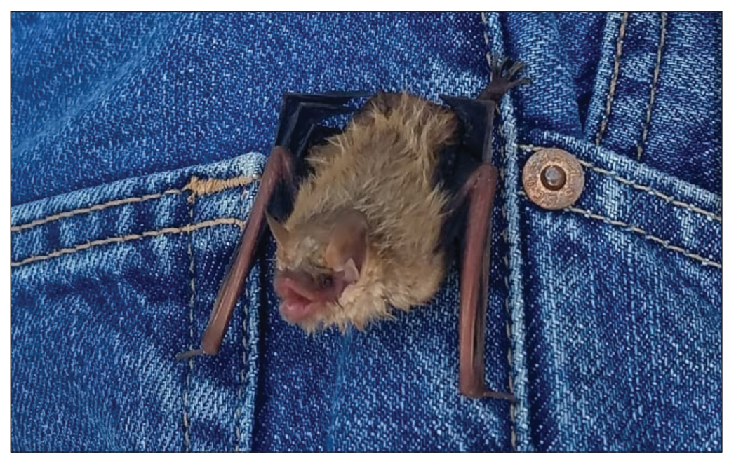
Figure 2. Tricolored Bat after landing on the boat captain 103.5 km off the coast of North Carolina.